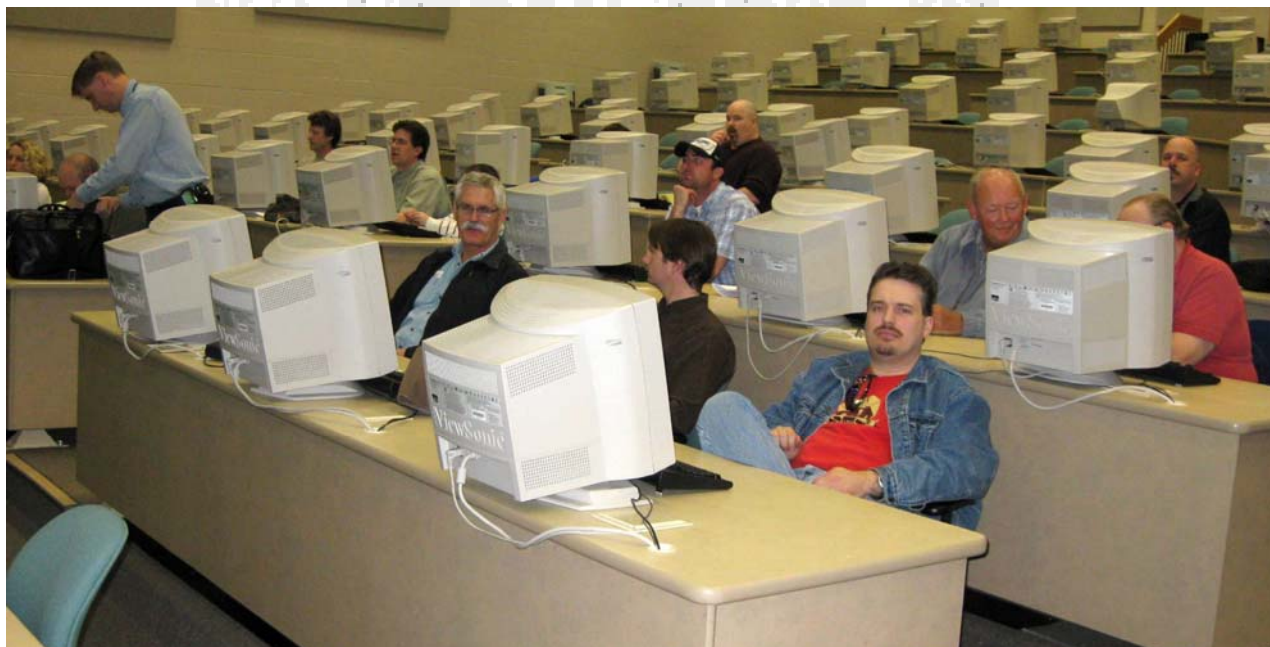
Participants in the CANWARN refresher session

Tornadoes - What to watch for; Rapidly rising massive white cumulous clouds, that appear to be "boiling", with overshooting tops, pushing up into the Stratosphere during hot hazy summer days, and Wall clouds (the lowering area) found at the back of the storm, exhibiting rotation.